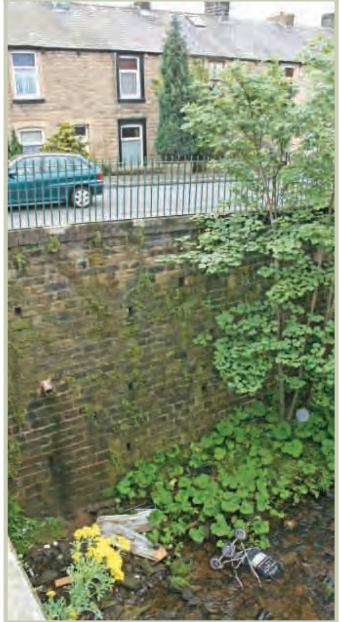
URBAN RIVER COLNE, EAST LANCASHIRE

to start if you are unsure. Again, help and guidance is available from, for example, the WTT, S&TA, Angling Trust (AT). If your prosecution is successful and damages are awarded – please do not automatically campaign for funds to be spent on fish stocking. Instead, first assess the physical and chemical habitat bottlenecks and lobby for funds to be directed to solving the environmental problems before resorting to fish stocking. There is no point in putting fish into degraded habitat they will either die or migrate out of the area.