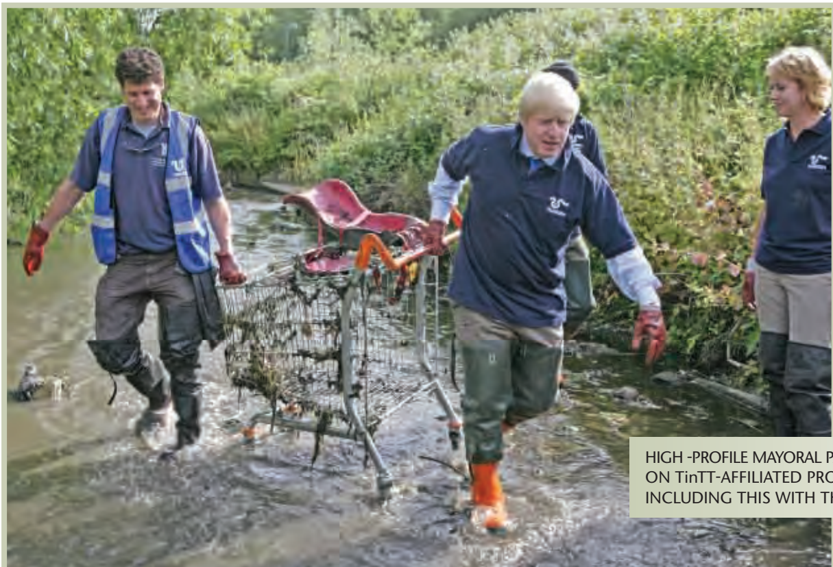
HIGH -PROFILE MAYORAL PARTICIPATION ON TinTT-AFFILIATED PROJECTS INCLUDING THIS WITH THAMES21

Appropriate use of flyer posting and letterbox drops can be a great way of letting people know what your project stands for, gathering volunteers