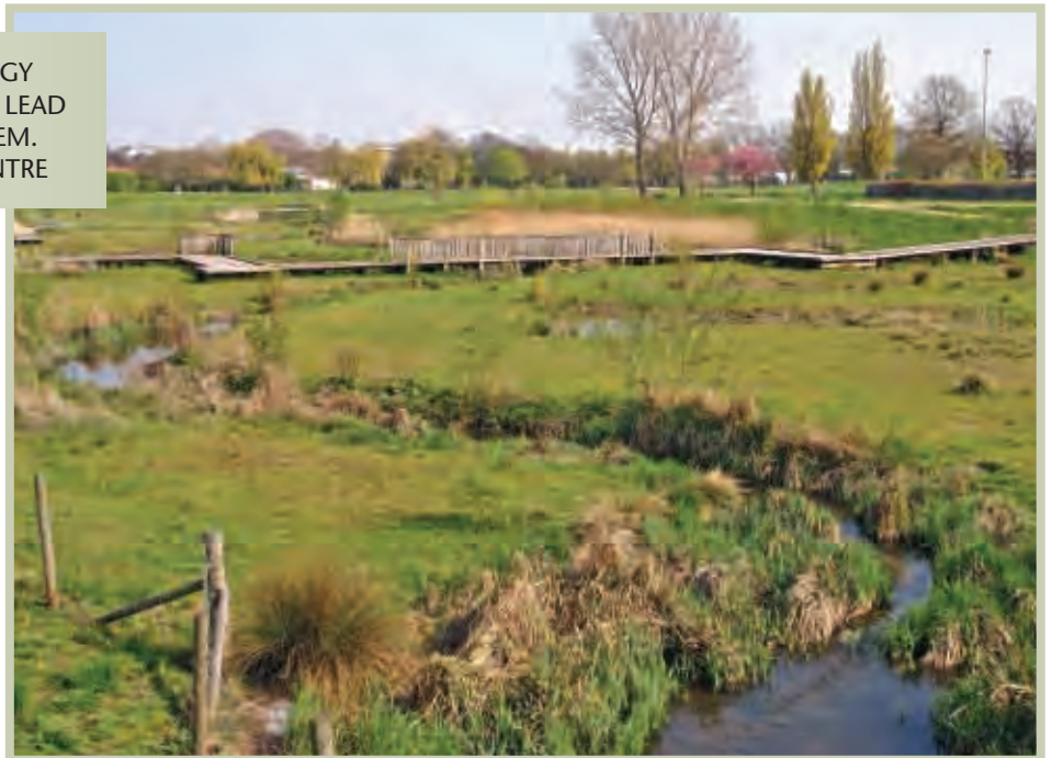
DE-CULVERTING OF THE RIVER QUAGGY AND CONNECTION TO FLOODPLAIN LEAD TO THIS LOVELY WETLAND ECOSYSTEM.

in order to provide tuition free of charge to local youngsters. Details of level 1 and level 2 Angling Development Board (ADB) coaching qualifications are available ( http://www.anglingtrust.net/land-ing.asp?section=27&sectionTitle=Angling+Development+Board ) and TinTT chapters are encouraged to run fishing taster sessions and coaching events, especially to try to involve young people. Informal teaching, practical participation, demonstration and the sheer enjoyment of responsible angling help to pass on the value of healthy urban rivers to future generations of river custodians.