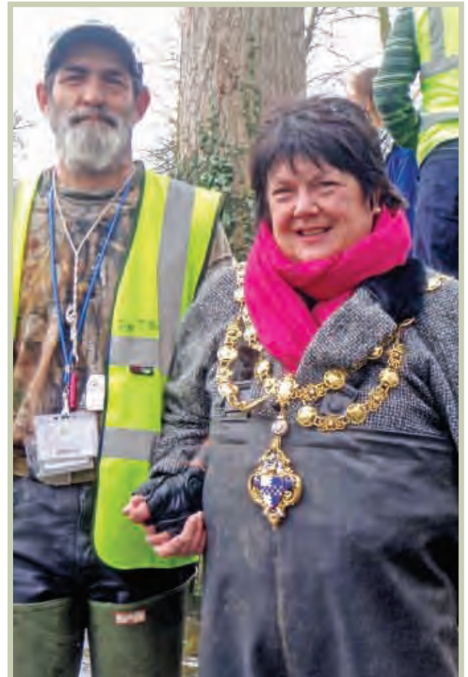
ANOTHER EXAMPLE OF MAYORAL PARTICIPATION ON TinTT-AFFILIATED PROJECTS, THIS BEING THE WANDLE TRUST

With trash clearance, it is far more important to send the sociological message that the river is valuable rather than seeing trash clearance as necessarily having a significant direct biological benefit. Thus, it may be better to leave some of the less visually intrusive trash in place to act as habitat – as long as it is not dangerous or leaching pollution into the river (i.e. it is not a battery, or a container of any kind of industrial/agricultural chemical). Of course, the setting of clear objectives must also include defining the boundaries for work activities at each particular event (e.g. specific upstream and downstream limits).