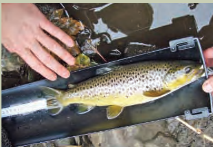
WILD TROUT CAUGHT, MEASURED AND RETURNED DURING FUN URBAN FLYFISHING COMPETITION (LEFT) WITH COMPETITION RESULTS USED TO PLOT BIOLOGICAL DATA (RIGHT) SUPPLIED TO LOCAL AND NATIONAL BIODIVERSITY DATABASES

The WTT or other expert bodies will be able to assist with the interpretation of biological monitoring data, as well as advising on how to collect and record such information. Furthermore, the template for sociological surveys developed in a partnership of the WTT and SUBSTANCE is expressly designed to yield clear, simple and easily interpreted responses. Just remember it is crucially important to identify and set appropriate and specific goals for project work. Once the goals are clear, it becomes obvious where to focus assessment efforts in order to judge success. Don't just know what to do, first know why it should be done and then be creative/seek advice on how to measure it. For example, the members of Lancashire's Colne Water Trout in the Town want to encourage scour pool formation to provide habitat for adult fish. To assess the success of physical structures in promoting stream bed scour, members of the