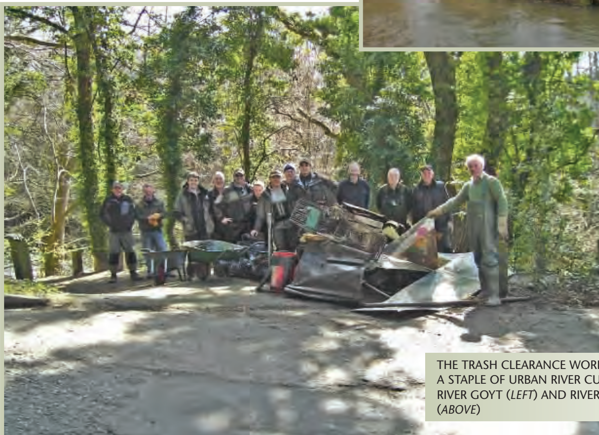
THE TRASH CLEARANCE WORKING PARTY - A STAPLE OF URBAN RIVER CUSTODIANSHIP! RIVER GOYT (LEFT) AND RIVER EREWASH (ABOVE)