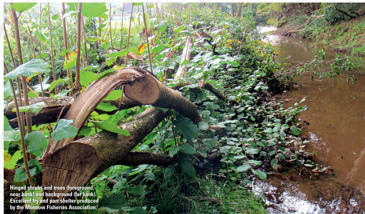
Hinged shrubs and trees (foreground, near bank) and background (far bank). Excellent fry and parr shelter produced by the Monnow Fisheries Association.

Finally, and most appropriately so far as this