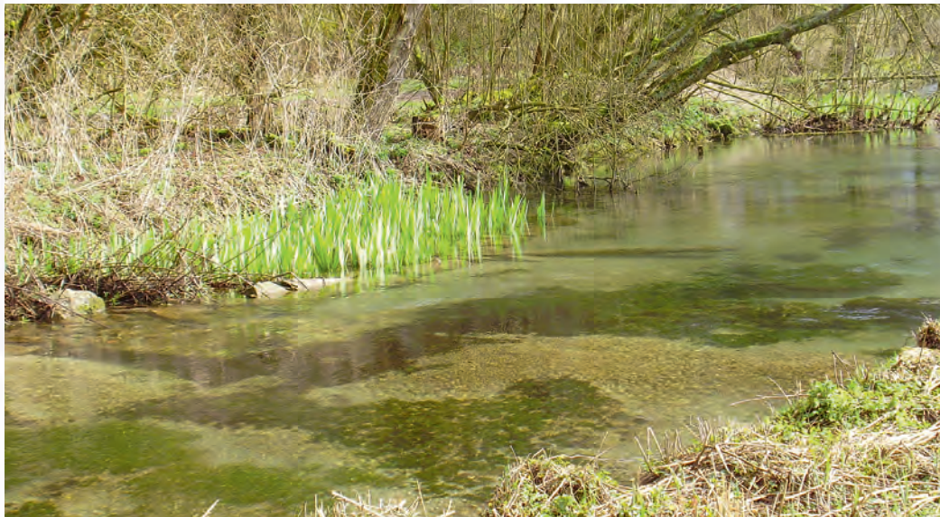
Flag iris beds (left of frame) are deliberately sited adjacent to spawning redds (the clean gravel mounds easily visible between the weedbeds). These plants provide cover for emergent fry.

Fry (the short transitional stage immediately after emerging from gravel, when they start to feed for themselves and disperse) need shallow water between 10 cm and 30 cm deep and a water velocity of between 0 cm and 30 cm per second.