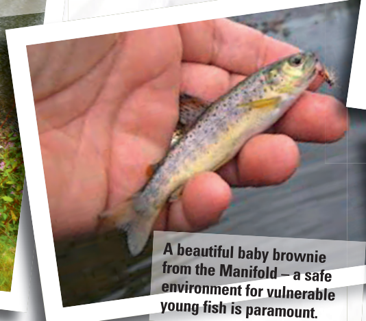
A beautiful baby brownie from the Manifold – a safe environment for vulnerable young fish is paramount.