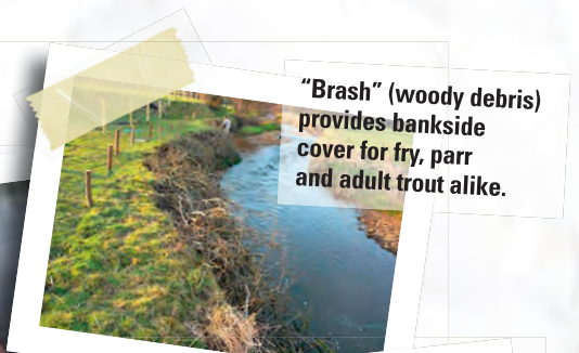
"Brash" (woody debris) provides bankside cover for fry, parr and adult trout alike.