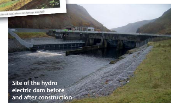
Site of the hydro electric dam before and after construction