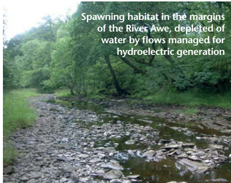
Spawning habitat in the margins of the River Awe, depleted of water by flows managed for hydroelectric generation

2012 was the first year of 'regime change' and initial indications appear favourable