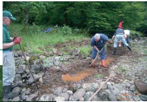
Digging channels to provide flows to disconnected spawning habitat

for fish recruitment after off-line spawning braids were re-connected to the main river by excavating channels. Redd counts in January 2013 found numbers of redds in the newly connected spawning habitat. More work is required to allow sufficient water into the spawning sites to maintain the eggs deposited, but not so much that the spawning gravel will be washed away during a flood release.