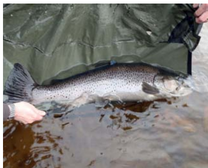
A 25-lb Loch Awe ferox caught by David Greenwood is released carrying a radio tag

With all our available tags deployed, I began the hunt to try and find where 'our' fish were hunting. Loch Awe is 41km in length and has a surface area of over 38km 2 so we knew that locating the tagged fish would not be easy. Regular weekend and evening trips were taken around the loch by road and over open water by boat, searching for a signal from the depths. Long hours finally paid off with four of the seven tags deployed being located by mid-summer. The recorded movements of these tagged fish have shown us that they move long distances, utilising habitat tens of kilometres from their original tagging sites. Unfortunately, none of these tags were retained on the fish until spawning time, so no data were collected on their movement in relation to the barrage and potential spawning sites. Lessons were learned and we are now planning to tag other fish in 2013 in a bid to gather the information we need to ensure that the celebrated Salmo ferox trout remain part of our wild brown trout heritage. 🐟