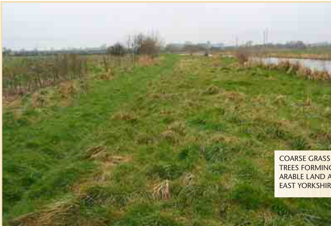
COARSE GRASS AND NEWLY PLANTED TREES FORMING A BUFFER STRIP BETWEEN ARABLE LAND AND THE DRIFFIELD BECK, EAST YORKSHIRE.

opportunities to promote ecologically favourable land management. Payments may be obtained, amongst others, for fencing of riverside buffer strips, reversion of arable land to grazing pasture and restoration of wet grassland habitat. In addition to the often attractive annual payments associated with management of designated land, one-off capital payments are also available.